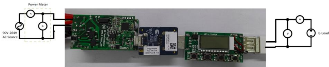
Figure 2: QC Test Setup for 45W PD/QC Demoboard