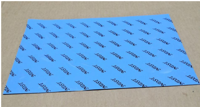
Products to be packaged