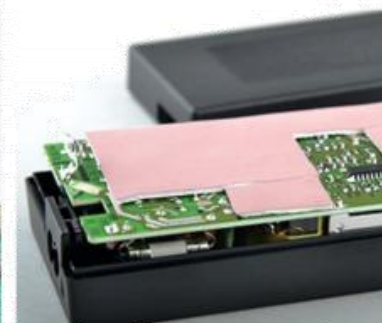
CP-120-B250 Series Thermal Thermal conductivity 2.5 W/m.K High electrical insulation Naturally adhesive on one side Low stress applications Good temperature resistance High thermal conductivity while also being flexible