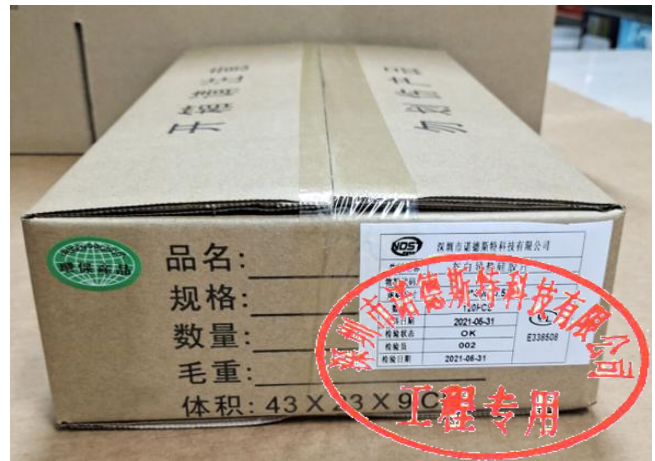
Seal the box after packing and attaching the external label and ROHS label