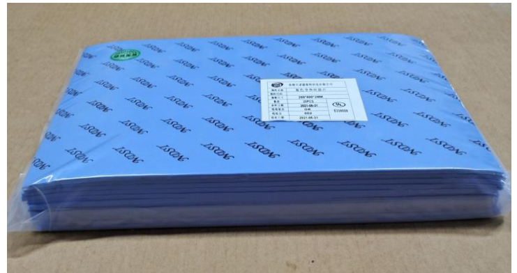
Place the product into a PE plastic bag and attach the inner packaging label