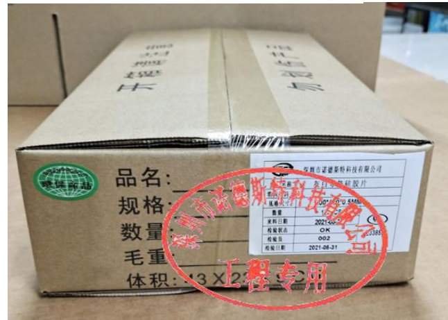
Seal the box after packing and attaching the external label and ROHS label