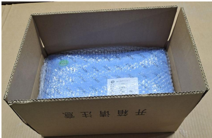
Place products with the inner labels attached into cartons, 20 PCS per carton