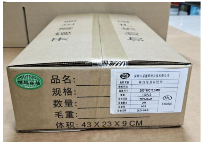
Seal the box after packing and attaching the external label and ROHS label