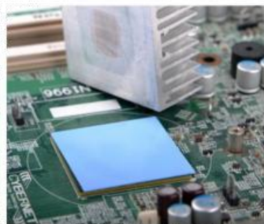
CP-120-T300 Series Thermal Thermal conductivity 3.0 W/m·K Double-sided adhesive Good electrical insulation Shockproof and vibration damping Good temperature resistance High cost-performance