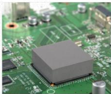
CP-120-T150 Series Thermal Conductive Silicone Pads Thermal conductivity 1.5W/m.k Double-sided adhesive Excellent electrical insulation Shockproof and vibration damping Good temperature resistance Highly compressible, soft and elastic

NDST-CP120 thermal conductive silicone gel is a high-purity kneaded silicone gel, compounded with specially formulated imported materials for heat dissipation and fire resistance in certain proportions, and processed with special techniques. It has single-sided self-adhesion, enhanced breakdown voltage resistance, and is a very soft thermal conductive silicone pad with excellent compressibility. It can make close contact with electronic components, effectively reducing interfacial thermal resistance, with excellent thermal conductivity performance. It can work stably in the range of -50°C to 150°C, while also meeting UL94V0 flame retardant requirements.