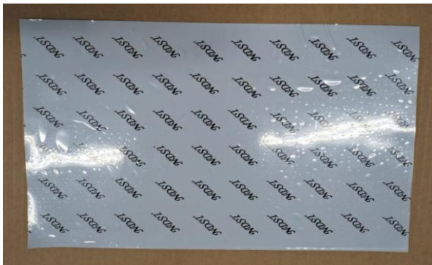
Products to be packaged