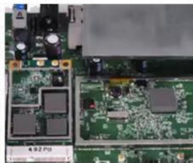
CP-120-T200 Series Thermal Thermal conductivity 2.0 W/m·K Adhesive on both sides Excellent electrical insulation Shock and vibration resistant Good temperature resistance Relatively high cost performance