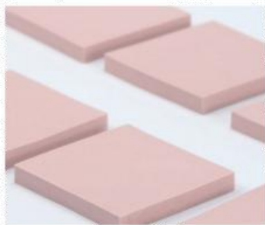
CP-120-T500 Series Thermal Thermal conductivity 5.0 W/m.K Double-sided adhesive Excellent electrical insulation Good temperature resistance High heat dissipation performance