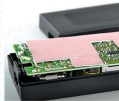
CP-120-B250 Series Thermal Thermal conductivity 2.5 W/m.K High electrical insulation Naturally adhesive on one side Low stress applications Good temperature resistance High thermal conductivity while also being flexible