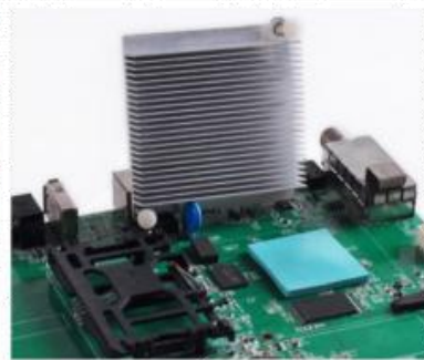
CP-120-T800 Series Thermal Thermal conductivity 8.0 W/m.K Double-sided natural adhesion High electrical insulation properties Low stress applications Good temperature resistance High thermal conductivity