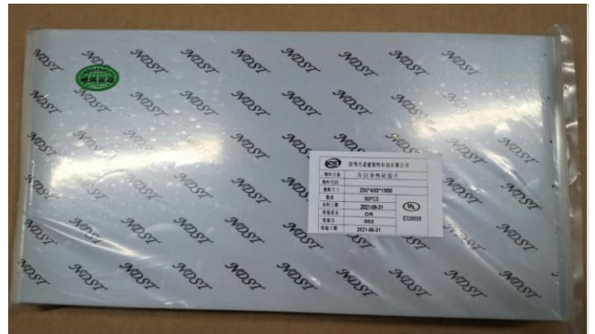
Place the product into a PE plastic bag and attach the inner packaging label