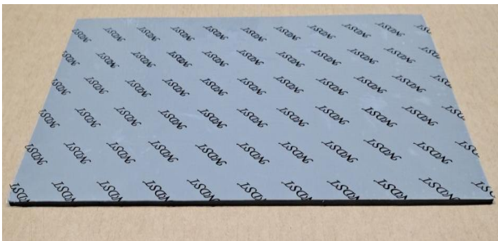
Products to be packaged