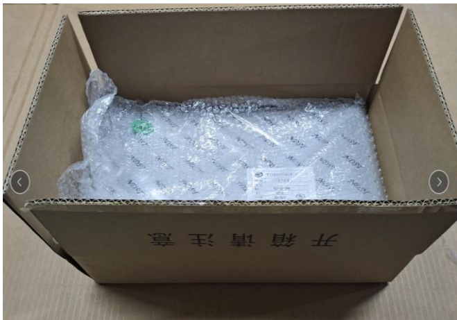
Place products with the inner labels attached into cartons, 20 PCS per carton