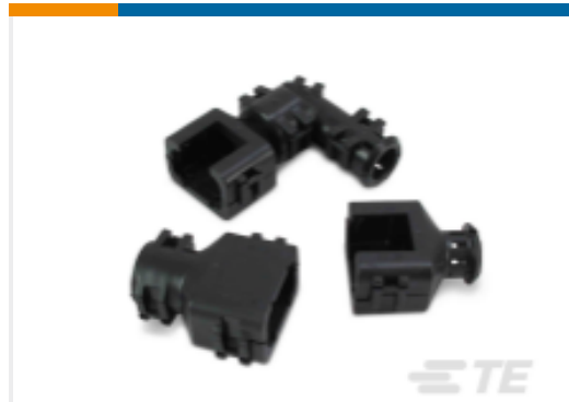
TE Part #2302488-3 AMPSEAL 16 Connectors Backshell