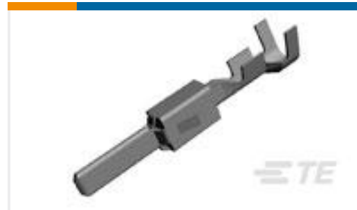
TE Part #1-1719504-1 TAB 2.8x0.8 CONTACT CS SWS Sn