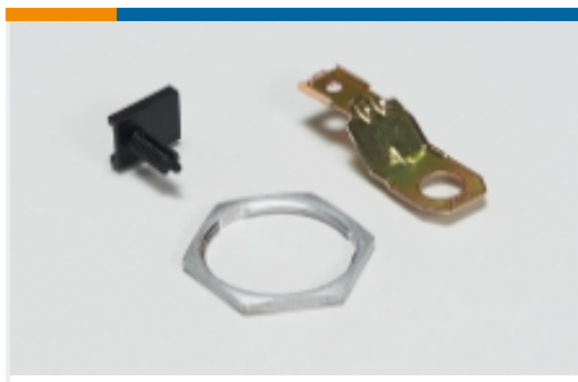
Other Automotive Connector Accessories(11)