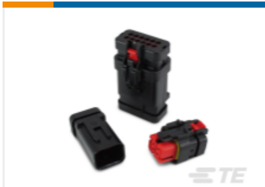
TE Part #776535-4 AMPSEAL 16 Housings