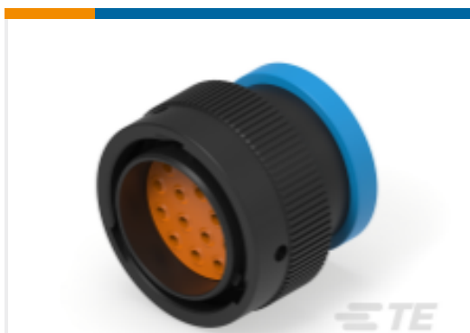
TE Part #HDP26-24-16PE-L017 PLG, 16P, BLK, E, RNG, 12, P