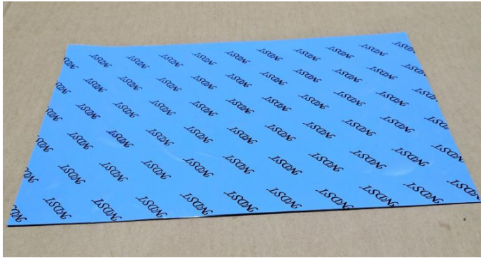
Products to be packaged