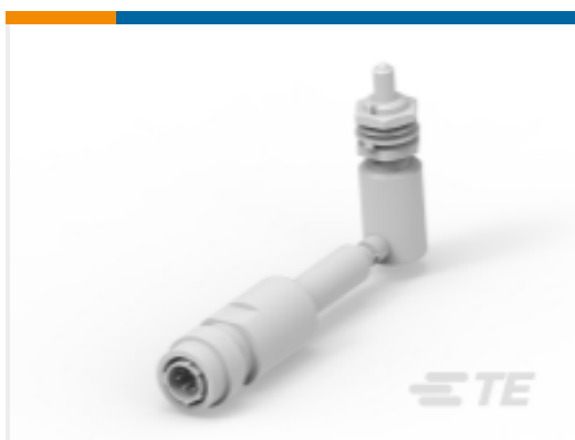
TE Part #K1143488 Limit switch G12-231-S-10 910