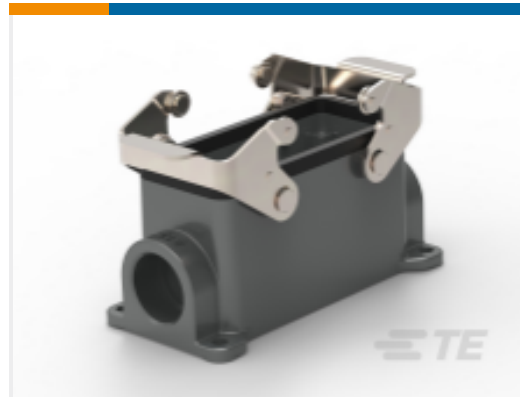
TE Part #T1440161121-000 H16B-SGRS-PG21