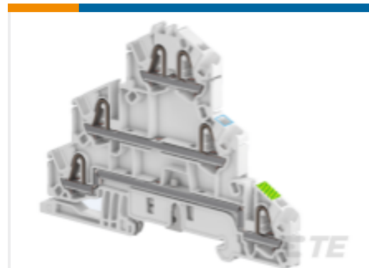
TE Part #1SNK705513R0000 ZK2.5-L-N-PE