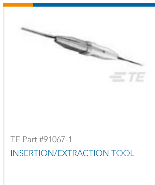
TE Part #91067-1 INSERTION/EXTRACTION TOOL