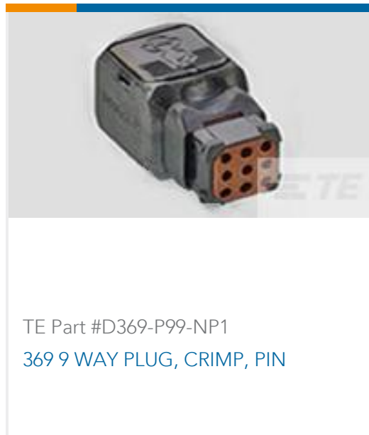
TE Part #D369-P99-NP1 369 9 WAY PLUG, CRIMP, PIN