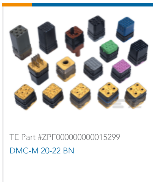
TE Part #ZPF000000000015299 DMC-M 20-22 BN