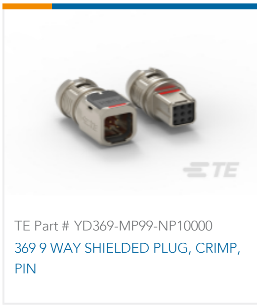
TE Part # YD369-MP99-NP10000 369 9 WAY SHIELDED PLUG, CRIMP, PIN