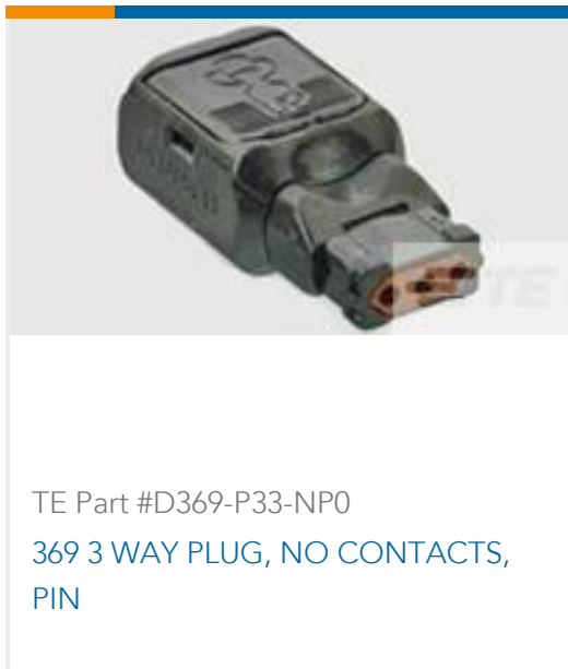
TE Part #D369-P33-NP0 369 3 WAY PLUG, NO CONTACTS, PIN