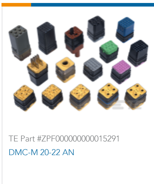
TE Part #ZPF000000000015291 DMC-M 20-22 AN