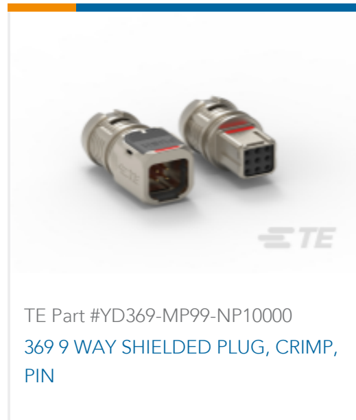
TE Part #YD369-MP99-NP10000 369 9 WAY SHIELDED PLUG, CRIMP, PIN