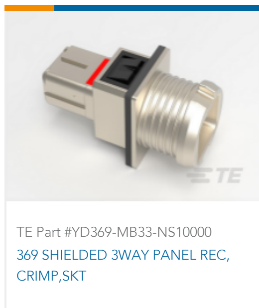
TE Part #YD369-MB33-NS10000 369 SHIELDED 3WAY PANEL REC, CRIMP, SKT