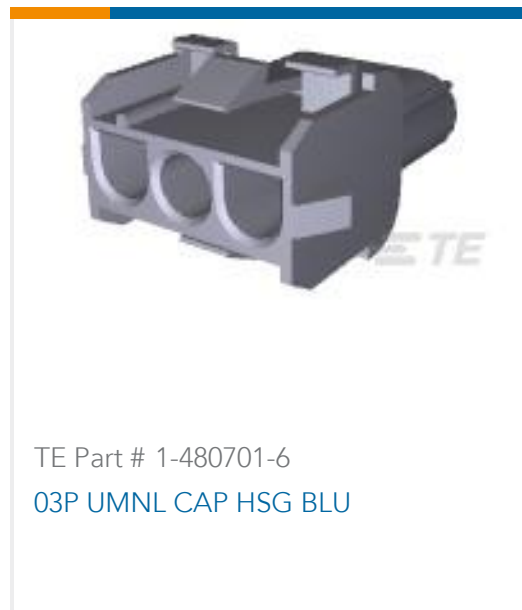
TE Part # 1-480701-6 03P UMNL CAP HSG BLU