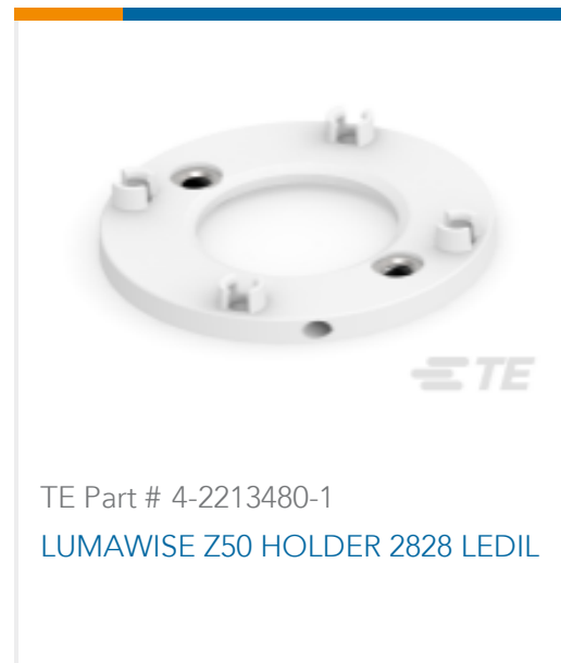
TE Part # 4-2213480-1 LUMAWISE Z50 HOLDER 2828 LEDIL