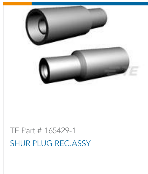
TE Part # 165429-1 SHUR PLUG REC.ASSY