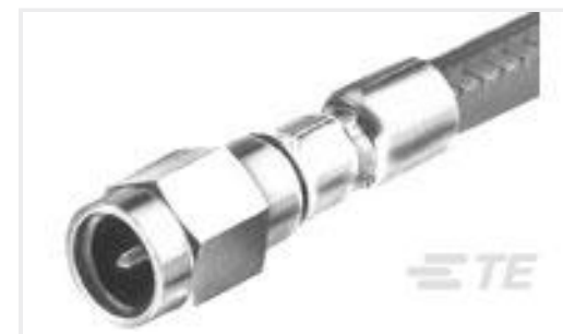
TE Part #221117-4 KIT, COMMERCIAL SMA PLUG ASSY