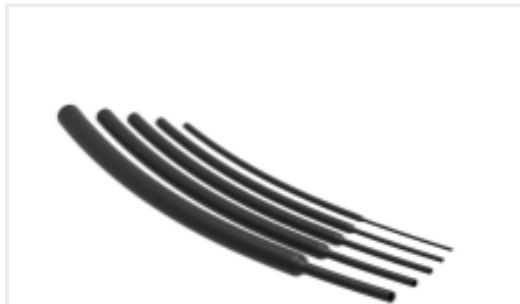
TE Part #NB14374001 VERSAFIT-3/4-0-SP