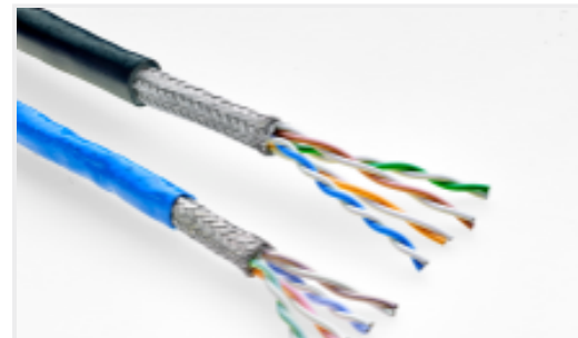
TE Part #EP9948-000 C5E-26C442XUU9A