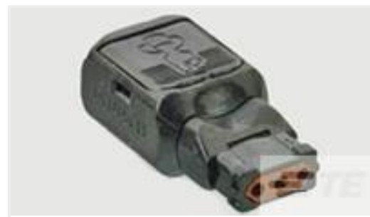
TE Part #D369-R33-BS1 369 3 WAY REC, CRIMP, SKT