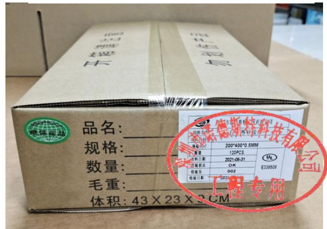
Seal the box after packing and attaching the external label and ROHS label