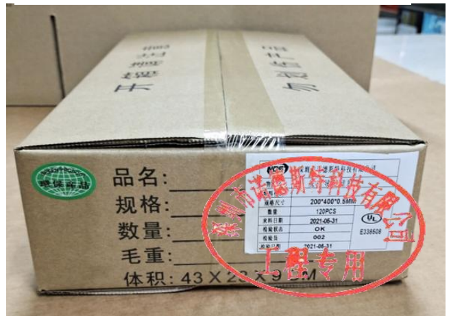
Seal the box after packing and attaching the external label and ROHS label