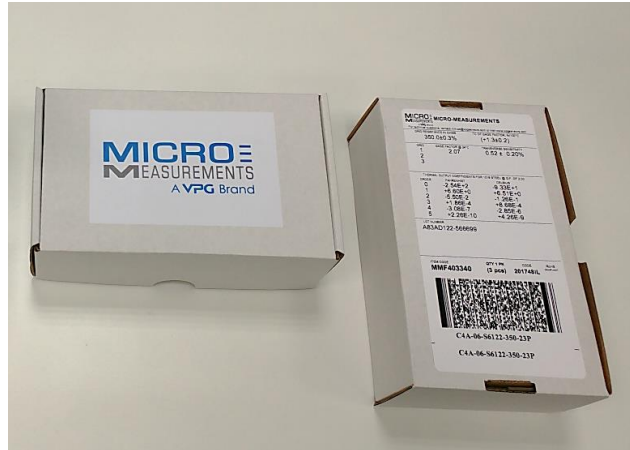
Engineering data is on the backside label